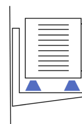
Motors and pumps